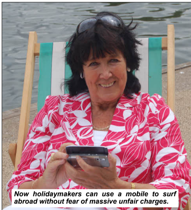
Now holidaymakers can use a mobile to surf abroad without fear of massive unfair charges.

Tougher rules to limit charges for using a mobile in other EU countries are a big boost for travellers, says Liz Lynne.