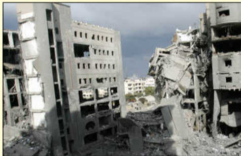
PIC: The devastation in Gaza as recorded by Architects and Planners for Justice in Palestine. Israel's ban on cement imports has prevented many repair works.

"International pressure can work. It is encouraging to hear now that peace talks have resumed, but it is vital that the EU and America keep up the pressure on both sides to agree."