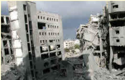
PIC: The devastation in Gaza as recorded by Architects and Planners for Justice in Palestine. The ban on cement has prevented many repair works

As Israel's largest trading partner, I believe there is a greater role for the EU, and specifically for the European Parliament, to play in promoting diplomatic peace negotiations and kickstarting a peace process."